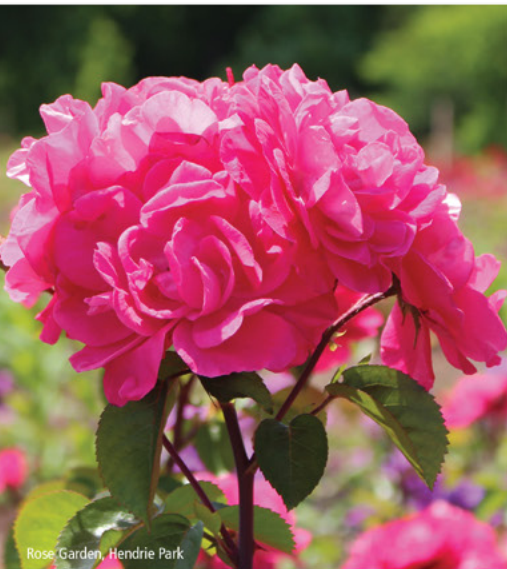
Rose Garden, Hendrie Park