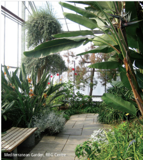
Mediterranean Garden, RBG Centre