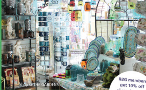
Shop @ THE GARDENS

RBG members get 10% off all regular priced items at the shop and all RBG restaurants.